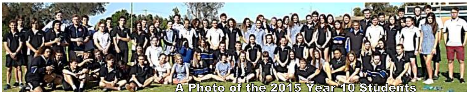
A Photo of the 2015 Year 10 Students